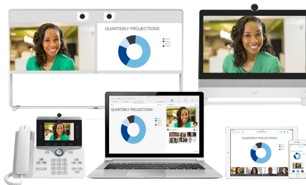
Figure 4. Meet from Any Device

Enjoy a rich meeting experience with audio, video, and content sharing across Android, iPhone, iPad and Apple Watch, Android wearables, and Windows Phone 8 devices.