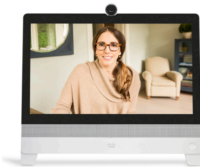
Figure 1. WebEx Meeting Center Video Conference

Increase engagement and build trust, just as you would in person, by inviting others to join meetings with their own standards-based video system, including Microsoft Skype for Business. Everyone can enjoy business-quality video at up to 720p resolution and content at up to 1080p resolution. With integrated HD video, view the active speaker and up to seven participants.