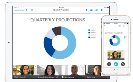
Figure 3. Meet from Mobile Devices

Securely create encrypted and password-protected recordings of your meetings for future reference, training, or demonstrations. Play back meetings from mobile devices as well (Figure 3).